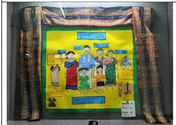
DRESS AND CLOTHING