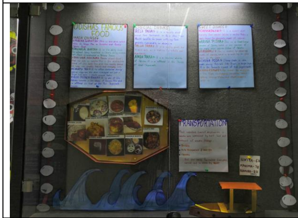
FOOD AND TRANSPORT