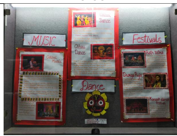
MUSIC AND DANCE FORMS