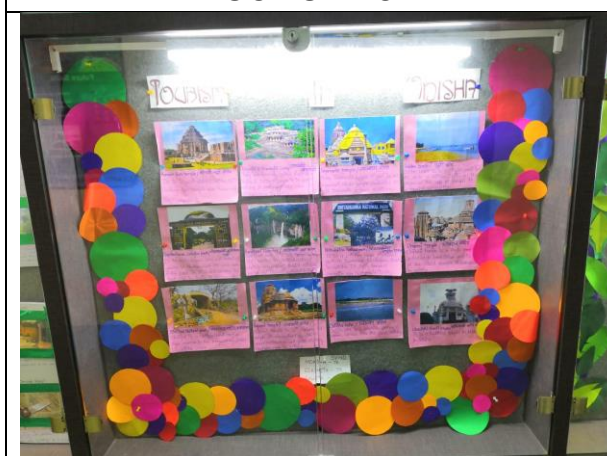
TOURISTS PLACES IN ODISHA